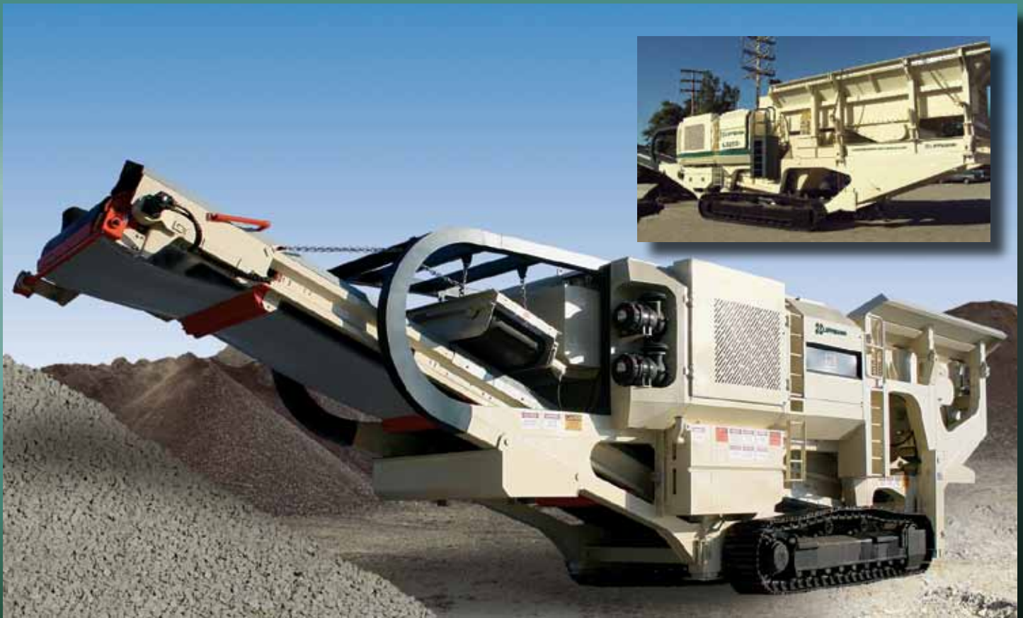
LT3252 TRACK-MOUNTED MOBILE JAW PLANT